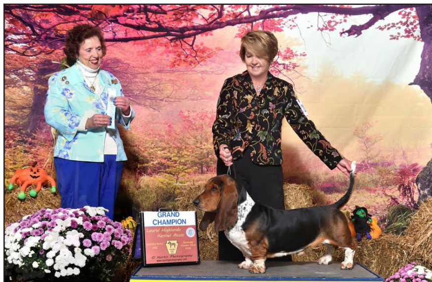
GCH 3 Oaks Bocephus Of The Killer B's, RN

March 18, 10 a.m at Central Rappahannock Regional Library England Run Branch 806 Lyons Blvd. Fredericksburg, VA