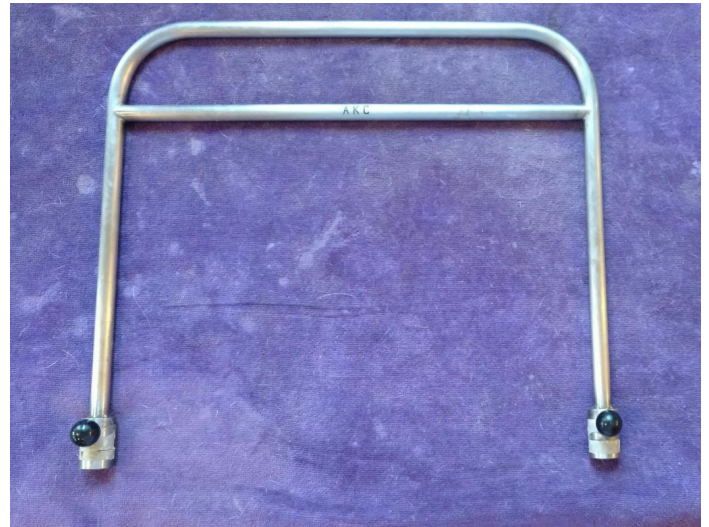
A standard wicket