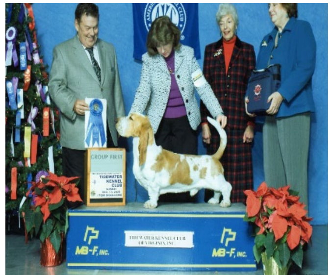
Group 1 Tidewater Kennel Club, December 2008