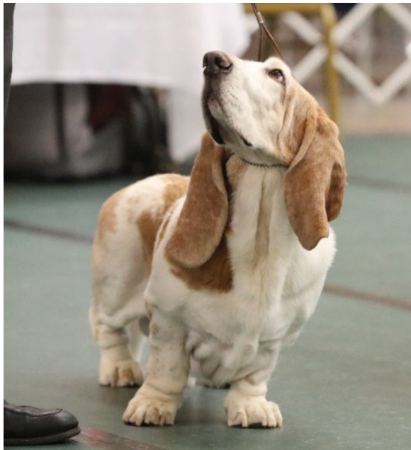
My favorite picture of him – BHCA Nationals 2018 - Best Veteran Dog THANKS TO ALL WHO CONTRIBUTED TO HIS LONG AND SUCCESSFUL CAREER!