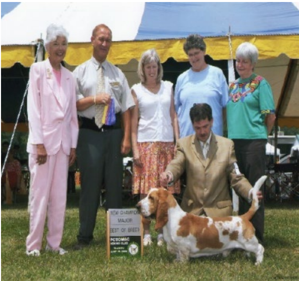
Calvin with his Breeders and Owner New Champion, June 2009